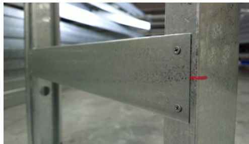
Flat nog - face fixed

*Please ensure that you follow the correct sequence when fixing Gib vertically. For further information refer to "GIB Steel Framing – Installation Details"