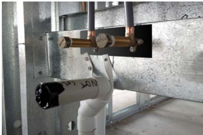
Flat nogg - setback into studs