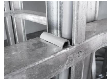
Protect piping beside noggs