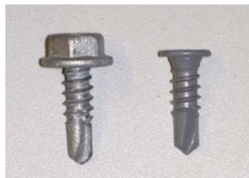
Hex-Tek & Flat Head

Flat noggs can be installed for wingbacks using Hex-Tek screws.