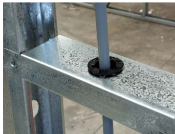
Manually drilled hole